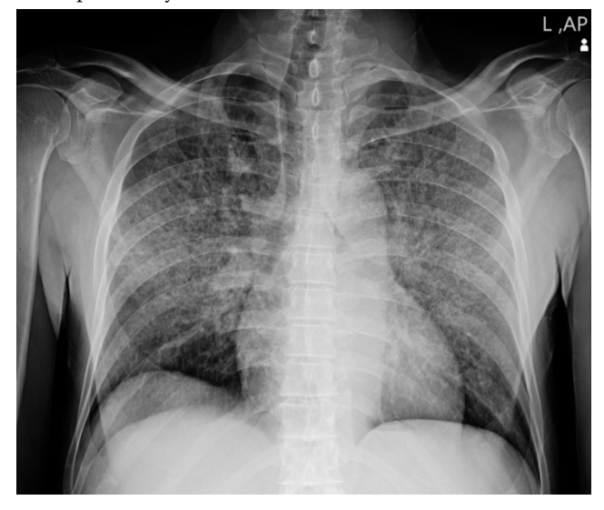
Figure 1. Chest X Ray Showing Bilateral diffuse reticular pattern

decreased to normal but BIPAP was used to keep oxygen saturation over 90%. General condition was good with no new findings in the chest exam. On the 7<sup>th</sup> day, the COVID-19 PCR report was negative. The patient had no sputum to be evaluated for microbiology and cytopathology. In reevaluation and new history taking, he reported no known tuberculosis contact history but mentioned unprotected extramarital affairs from 10 years ago as multi-partner with sex workers. He had mild chronic diarrhea and weight loss in the past two years.