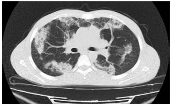
Figure 1. CT scan of the chest demonstrates areas with ground glass opacities

scintigraphy and bone marrow aspiration were performed to rule out malignancy; both were negative in terms of malignancy and the FIP1L1-PDGFR gene (FIP1/platelet-derived growth factor). The results of electromyography and nerve conduction velocity were also normal. The results of other laboratory tests, including purified protein derivative, angiotensin-converting enzyme, antinuclear antibody, anti-ds-DNA, peripheral antineutrophil cytoplasmic antibodies, galactomannan, and HIV were negative. Serum protein electrophoresis had a normal pattern. Serum levels of immunoglobulin and different CD markers were also normal.