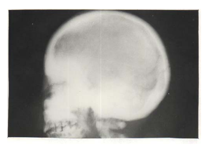
Figure 1. Skull x-ray shows diffuse sclerosis of the skull base and mastoid process.