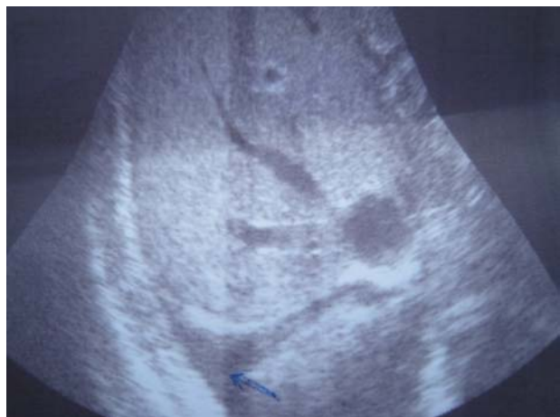
Figure 3. Abdominal ultrasound showed ascites without hepatosplenomegaly

Right ventricle was partially collapsed but left ventricle was normal.