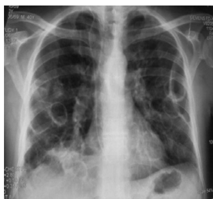
Figure 1. Chest x-ray of the patient.

A 40 year-old taxi driver residing in Tehran presented with two episodes of massive hemoptysis following a 3-week period of productive cough, dyspnea on exertion, fever, night sweat, anorexia and weakness. He was a heavy smoker (40 packs per year), and an IV drug user since 5 years ago with a history of imprisonment 3 years ago. He had no history of alcohol consumption or unprotected sexual contact. His physical examination revealed poor oral hygiene, diffuse coarse crackles in lungs, edema of the lower extremities which was dominant in the left leg and no petechia, purpura or any other skin lesion. He had normal blood biochemistry, liver function tests and electrolytes. Complete blood count revealed a microcytic, hypochromic anemia with a PMN dominant leukocytosis and normal platelet count. Erythrocyte sedimentation rate was 87. PPD was non-reactive and 3 times sputum smear for acid fast bacilli was negative. Urinalysis was normal. Chest x-ray (Figure 1) and lung CT-scan (Figure 2) were performed. Transthoracic and transesophageal echocardiographies (TTE & TEE) were reported to be normal without vegetation or other abnormalities. ( Tanaffos 2010; 9(2): 69-71)