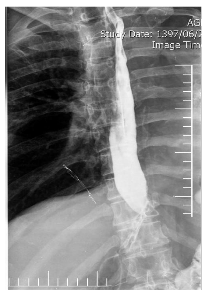
Figure 4. Thin barium esophagogram