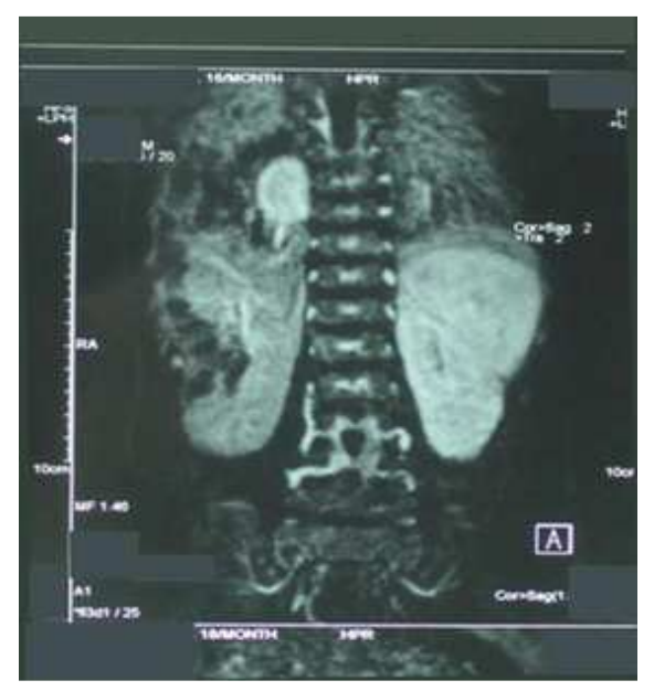
Figure 4. Magnetic resonance urography of patient.

- Magnetic resonance angiography (MRA) showed the right artery arising from abdominal aorta. (Figure-5).