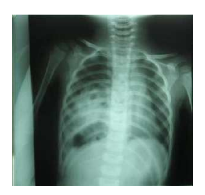
Figure 1. CXR of patient.

Chest radiography showed an opacity and air blebes at the base of right lung. (Figure-1)