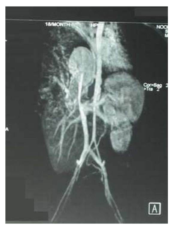
Figure 5. Magnetic resonance angiography of patient.

- Magnetic resonance angiography (MRA) showed the right artery arising from abdominal aorta. (Figure-5).