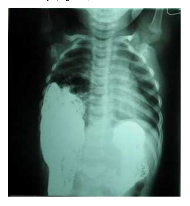
Figure 3. Upper GI series of patient.

- Upper gastrointestinal (GI) series showed right diaphragmatic hernia with bowel displacement in thoracic cavity. (Figure-3)