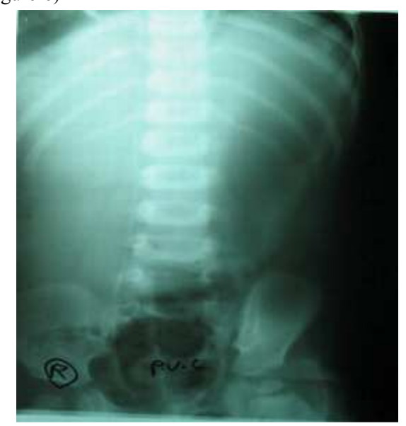
Figure 6. Voiding cystourethrogram of patient.

- Voiding cystourethrogram (VCUG) of patient showed grade two right vesicoureteral reflux (Figure-6)