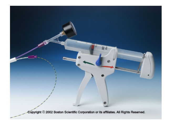
Figure 2. Special syringe for inflating the balloon with the designated pressure.

Deflated balloon is inserted into the bronchoscope, passes the stricture and then is inflated using an inflator gun with designated pressures.