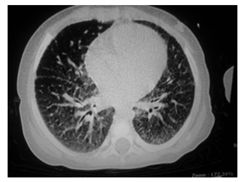
Figure 3. HRCT of thorax showing bilateral diffuse micro-nodular opacities