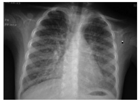
Figure 1 . Chest X-ray showing bilateral diffuse high density micronodular opacities.

VBG: PH: 7.3 PCO2:48 HCO3:23 PaO2:55 CBC: Hb: 13.6 WBC: 6.99 (N: 39%, L: 59%) PLT: 406000 ESR: 12 RP: Negative LDH: 560 HIV: Negative PPD: 5mm; after 3 gastric lavages the result was negative for TB.