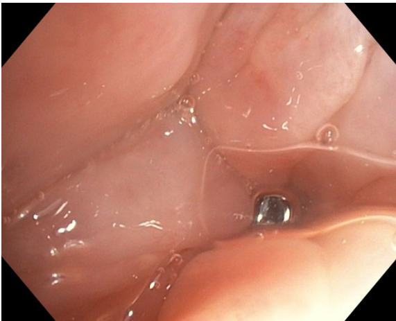
Figure 1. Initial bronchoscopic view of the glottis above the level of the vocal cords with significant edema and poor visualization of anatomic landmarks .

An 8.0 cuffed Shiley tracheostomy tube was placed on post-procedure day 18 using a Ciaglia Blue Rhino® G2 advanced percutaneous tracheostomy introducer and tray (Cook Medical, Bloomington, IN) (5). Two days later the tracheostomy was slowly but continually leaking, causing derecruitment and hypoxia. Prior intubations were performed via indirect laryngoscopy showing easy views of normal anatomy, and the patient had no external neck swelling, edema or anatomic abnormalities. Nonetheless, bronchoscopic visualization of the airway was exquisitely challenging (Figures 1 & 2) and severe enough to have precluded direct or indirect laryngoscopy guided orotracheal reintubation of the airway in case of emergency. To improve safety in case of tracheostomy exchange failure, we loaded an endotracheal tube onto the bronchoscope, entered the subglottic airway and performed the procedure under bronchoscopic visualization. This would enable orotracheal reintubation rescue via the bronchoscope. Thankfully, the procedure was uncomplicated. It was discovered that the tracheostomy cuff had a small puncture hole.