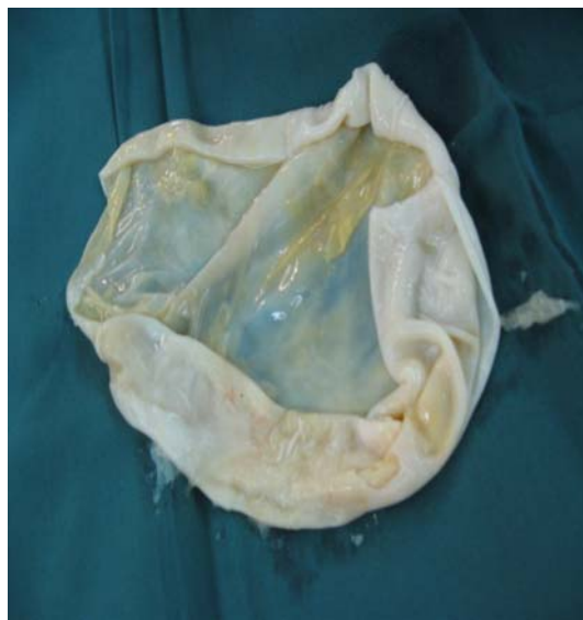
Figure 4. The large hydatid cyst was surgically removed.