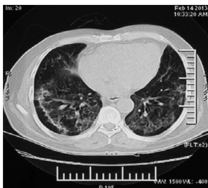
Figure 2. Chest CT-scan of patient.