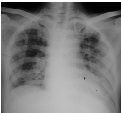
Figure 1. Chest x ray of patient.

Fiberoptic Bronchoscopy was normal. Transbronchial biopsy is shown in Figure 3.