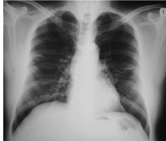
Figure 5. Chest-X-ray 8 weeks after treatment with itraconazole.