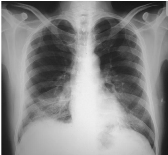
Figure 1. The left chest-X-ray revealed alveolar infiltration in the right lower lobe before diagnosis.

Due to progressive symptoms and significant weight loss as well as chest imaging findings (Figure 1), bronchoscopy was performed without remarkable findings. Due to antibiotic treatment failure, he had been treated with standard anti-tuberculosis regimen for 6 weeks in another center without any response.