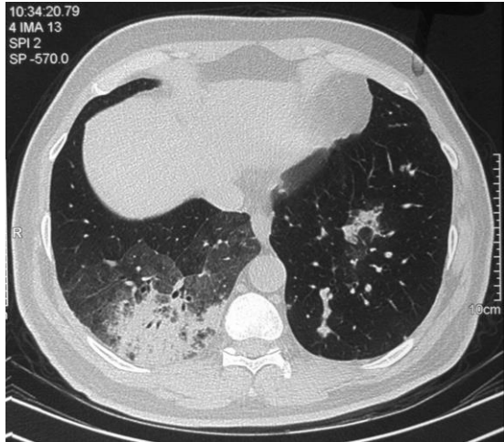
Figure 2. Chest CT revealed alveolar consolidation and adjacent ground glass opacity in the right lower lobe.