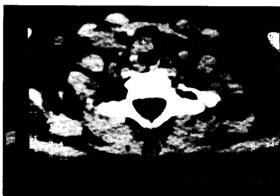
Fig 1. Ct scan shows an intratracheal mass

The patient underwent tracheal resection through a transverse cervical incision. Surgeon cut the thyroied isthmus and tumoral mass was thyroied isthmus and tumoral mass was explored. The mass was located at the beneath of the right-lobe. Specimens were obtained from the adjacent thyroid tissue, the upper margin (cricoid), and the lower margin (trachea) were sent to pathology department for frozen section, however, all the four samples were revealed to have no tumoral involvement. About 3.5 cm of trachea was resected and end-to-end anastomosis