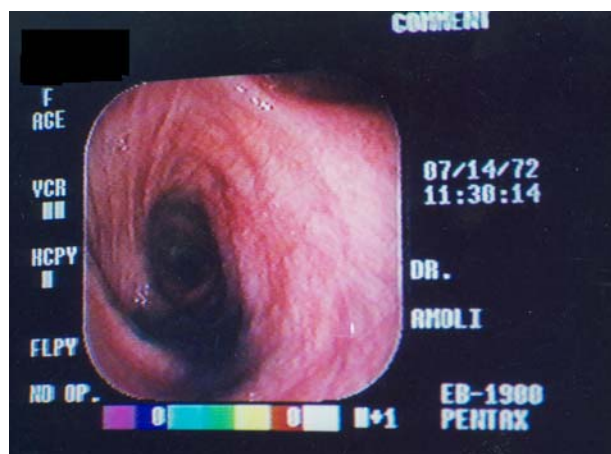
Figure 1: Bronchoscopic view of a 50-year-old rustic non-smoker female who was referred with cold, fever, cough, sputum, dyspnea and wheezing. Anthracotic deposits were seen at the entrance of right main bronchus extending to the right upper lobe. Note the mucus particles protruding from the widened submucosal glands openings. She had a long history of household bakery using dung and wood, causing a heavy smoke.

In anthracotic patients, generalized swelling and congestion were found in the airways with infiltration, thickening, bulging and tortuosity. Luminal narrowing ensued so that the bronchoscope could not pass through and occlusion occurred, notably in the right middle lobe. Black mucous or mucopurulent secretions appeared in moderate quantities from both sides and the openings of the mucous glands were widened. Characteristically, there were multiple plaques of black deposits (Figure 1) not only on the surface of the airways, mainly in the lobar and segmental divisions, but also in the trachea and subsegmental branches. The epithelium was slightly raised and fragile with a tendency to bleed.