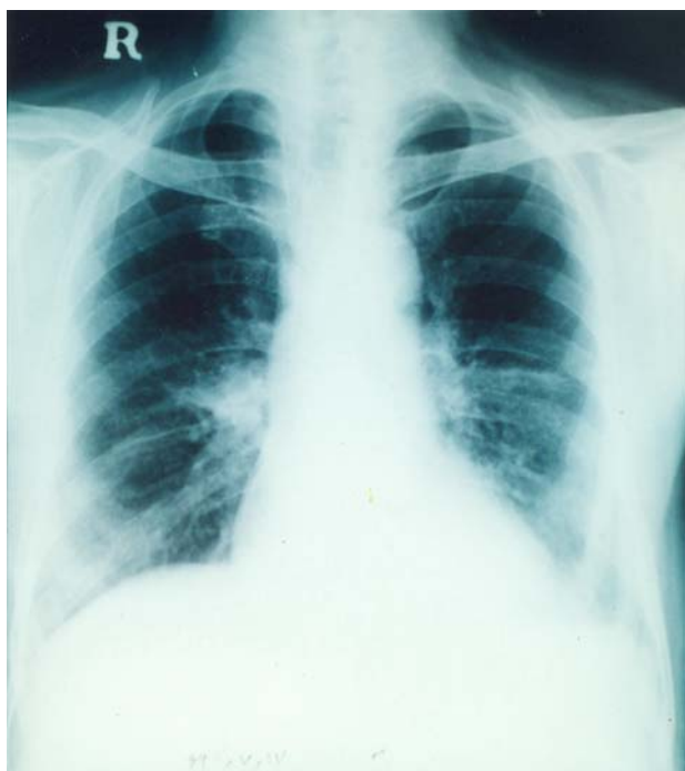
Figure 3: Chest X-ray of a 75 year-old nonsmoker male farmer who worked as a cook, baker and gardener. Note the hilar opacities and streaky paracardiac shadows mainly on the right side with downward displacement of the interlobar fissure. He used to enjoy burning twigs and sweepings in his garden for both heating and disposal. He became gradually dyspneic on walking uphill. Widespread anthracotic plaques were found on bronchoscopy

Radiologic findings in the control group were related to their specific diseases (Table 3) that are irrelevant to the original topic of the present article. All the anthracotic patients had abnormal chest x-rays. The basic findings were streaky shadows along the bronchovascular markings in paracardiac and parahilar regions that obscured the cardiac borders (Figure 3). Additionally, in relation to the associated diseases (vide infra) a variety of fixed or transient opacities occurred due to consolidations, fibrosis, atelectasis and tracheal deviation. Hilar adenopathy was not outstanding. CT-scan complemented the chest x-ray findings.