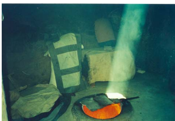
Figure4: A small room for baking bread with no windows. All the walls and the tools are covered with soot. A column of sunshine demonstrates the thickened dust-filled air while the fire glows out from the oven.

Is there a connection between the past history of these patients with the anthracotic lesions? Of course none of them had been followed up prospectively from the beginning of their exposures to smoke down to their present state. Nevertheless, there are objective reasons to presume the relationship. First is the observation of the actual condition of the environment they used to work. Several localities were visited around the country where, as mentioned above, small enclosures are used by the rustic housewives for bakery during the cold winters. The place is blackened by the smoke (Figure 4) which, although unpleasant, is not irritant enough to keep off the individual. There are no windows and the walls are covered by a thick deposition of soot that is also easily accessible to the respiratory tract of the baker. The same circumstances apply to the working places of the male patients. For example, tunnels of mines and road industry were found to have almost no visibility due to smoke and all the framework was covered with soot. Unfortunately, the preventive measures are not efficiently followed.