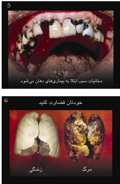
Figure 1. Pictorial warning labels.