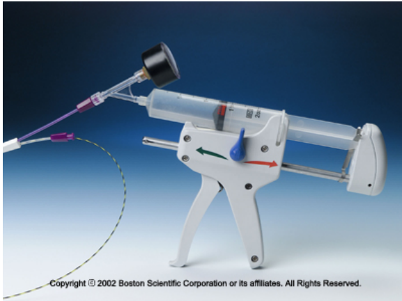
Figure 2. Special syringe for inflating the balloon with the designated pressure.

Deflated balloon is inserted into the bronchoscope, passes the stricture and then is inflated using an inflator gun with designated pressures.